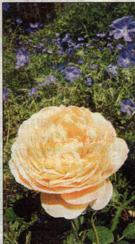
A golden celebration rose on display in the David Austin Rose Garden at Matterhorn Nursery.

From noon to 5 p.m. Sunday, the new garden will be open free of charge to the public. From then on, visitors touring the garden will be asked to pay a nominal fee ($5 for adults, $4 for seniors, $3 for