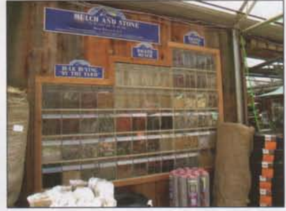
Buy the yard, buy the bag—an organized deciphering of oft-puzzling products.