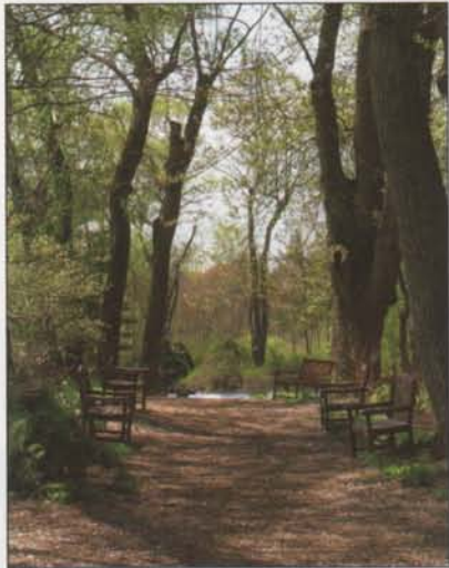
Relax and unwind in this apropos ensemble of "destination retail."