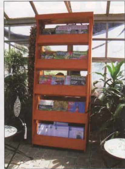
Perhaps speaking from an editor's point of view, there's no reason magazines need to be an afterthought by the register. Let the pages provide inspiration along the way. 🌿