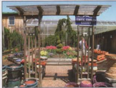
Indoors or outdoors, each section greeted customers with a vertical welcome mat.